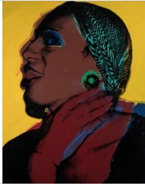
Andy Warhol (1928 – 1987) Ladies and Gentlemen (Wilhelmina Ross) 1975 Acrylic paint and silkscreen ink on canvas 1270 x 1016 mm Italian private collection © 2019 The Andy Warhol Foundation for the Visual Arts, Inc / Artists Right Society (ARS), New York and DACS, London