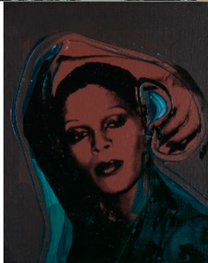
Andy Warhol (1928 – 1987) Ladies and Gentlemen (Iris) 1975 Acrylic paint and silkscreen ink on canvas 356 x 279 mm Italian private collection © 2019 The Andy Warhol Foundation for the Visual Arts, Inc / Artists Right Society (ARS), New York and DACS, London