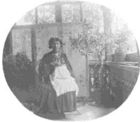
Sophie Taeuber with embroidery hoop