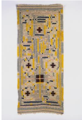
Johannes Itten, Picture Rug