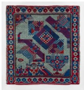
Johannes Itten, Rug ca. 1920 knotted wool, Smyrna technique 133 x 142 cm Zurich University of the Arts / Museum für Gestaltung Zürich / Decorative Arts Collection

Kunstmuseum Thun Thunerhof, Hofstettenstrasse 14, 3602 Thun T +41 (0)33 225 84 20 / F +41 (0)33 225 89 06 kunstmuseum@thun.ch, www.kunstmuseumthun.ch