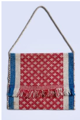
Gunta Stölzl, "Landitasche" bag for the Swiss National Exhibition (Landi) 1939 rib weave cotton 20 x 24 cm Private collection