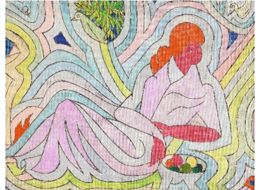
Johannes Itten, Woman with the Birds